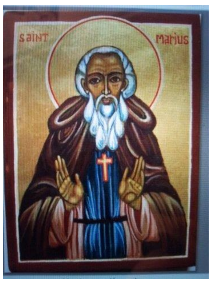
ICON OF SAINT MARIUS